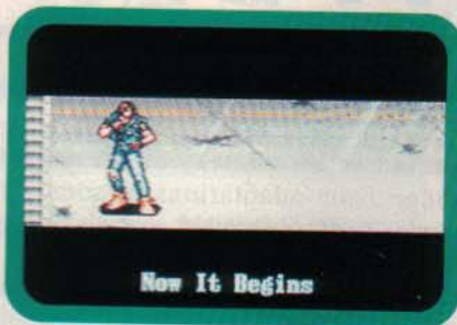
Now It Begins